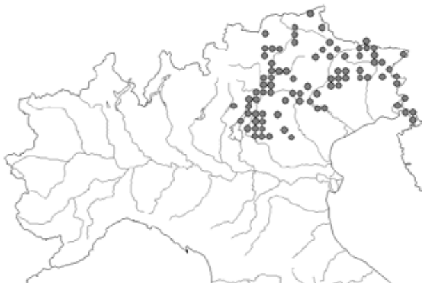
Map 5. Distribution of Ocybus tenebricosus in Italy (from Pilon 2005)