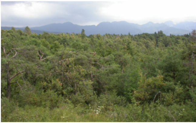
Fig. 1 Thermophilic mixed forest (Coredo).