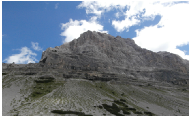
Fig. 2 Firmetum (Gruppo del Brenta near Malga Flavona) – habitat of Eusphalerum pulcherrimum .