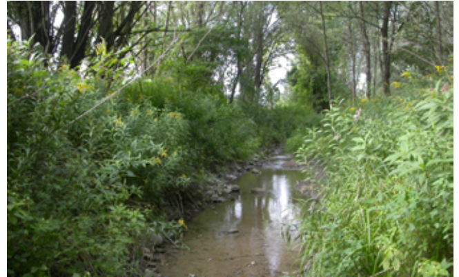
Fig. 12 Riparian forest with Salix alba (La Rocchetta) – habitat of Carpelimus opacus .

At least some representative specimens of each species were mounted. Habitats described below were visited in about 90 localities. Some of them, mostly those in the vicinity of the village Smarano, were investigated many times and in different seasons with several methods, others only once with a single method. For this reason the list of species is probably rather incomplete, mostly considering the absence of several rare entities found in adjacent areas.