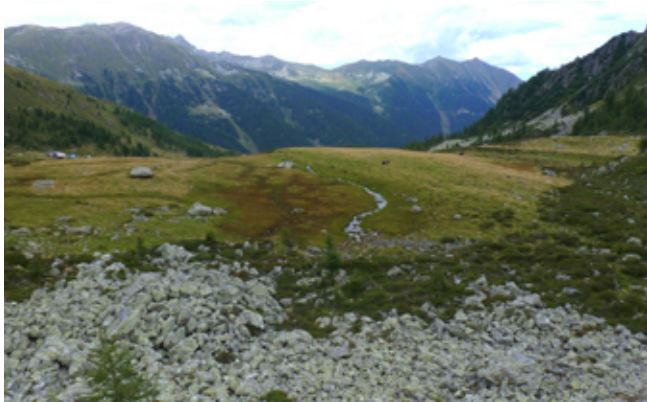
Fig. 11 Peaty plain near Malga Preghena – habitat of Atheta fallaciosa , Gnypeta coerulea and Oxyptoda ignorata .