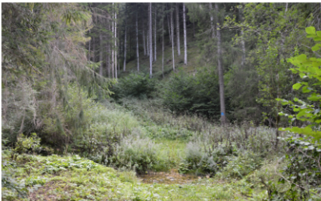
Fig. 5 Bottom of narrow valley with Cirsium montanum (Valle di Verdès) – habitat of Atheta pfaundleri .