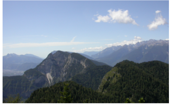
Fig. 10 Ridge of the Catena della Mendola with Corno di Tres – habitat of Maurachelia pilosicollis .