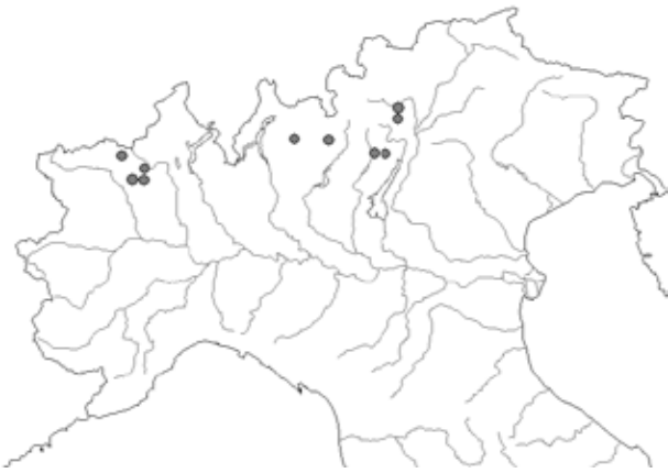
Map 1. Distribution of Eusphalerum pulcherrimum in Italy (from Zanetti, 2005)