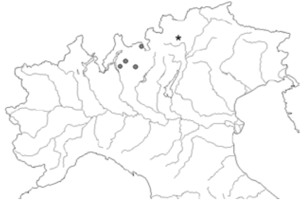
Map 2. Distribution of Leptusa fauciumberinae in Italy (from Zanetti & Pace 2005, asterisk for the new record in Val di Non).