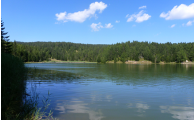
Fig. 9 Lago di Santa Maria / Felixer Weiher with wetland – habitat of Cephalocousya nivicola .