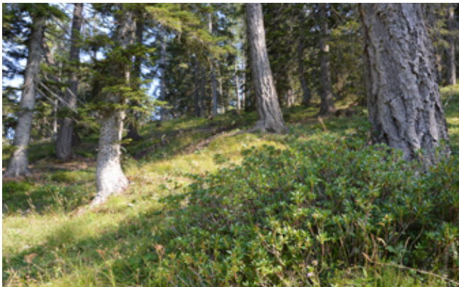
Fig. 3 Montane-subalpine open forest (Malga di Coredo) – habitat of Dropephylla linearis .