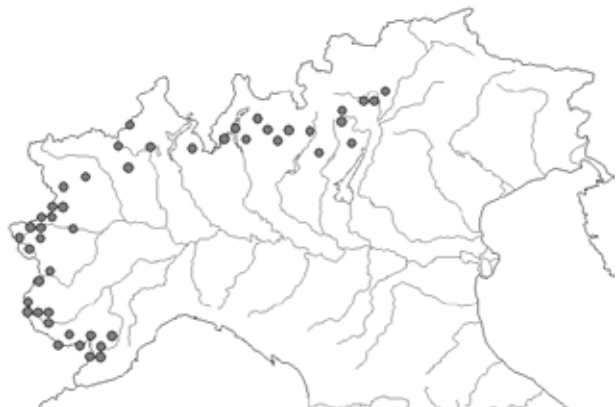
Map 6. Distribution of Ocybus chevrolatii in Italy (from Pilon 2005)