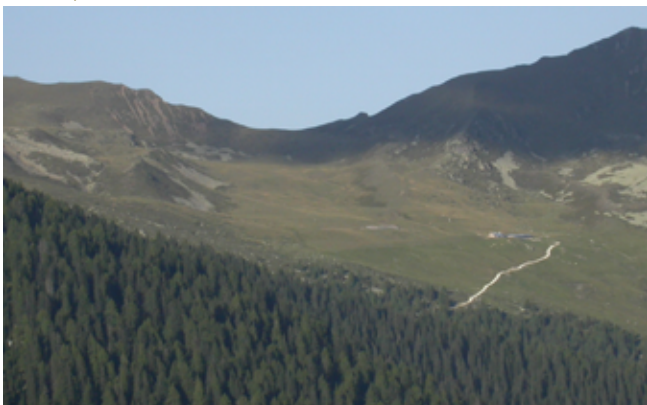
Fig. 7 Subalpine meadows with Rhododendron ferrugineum (Malga Bordolona) – habitat of Leptusa fauciumberninae .