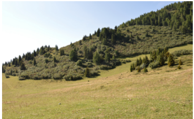
Fig. 4 Subalpine meadows and Alnetum viridis (Monte Peller) – habitat of Atheta alpigrada and A. reissi in Marmota nests.