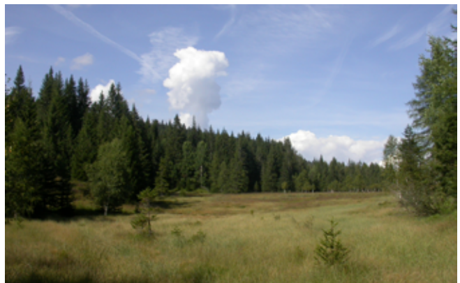
Fig. 8 Peat bog near Palù Longia (Brez) – habitat of Cypha carinthiaca .