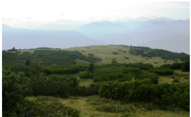
Fig. 6 Summit of Monte Roen with Pinus mugo – habitat of Liogluta micans .