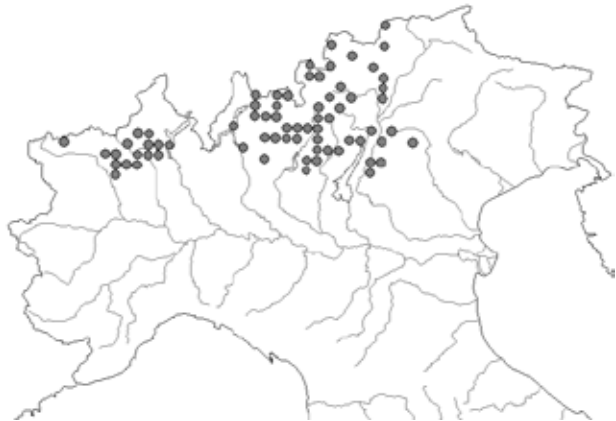
Map 4. Distribution of Ocybus rhaeticus in Italy (from Pilon 2005)