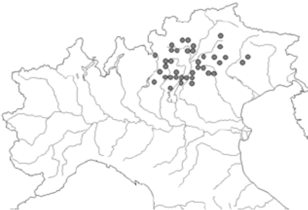
Map 3. Distribution of Leptusa pseudoalpestris (from Zanetti & Pace 2005)