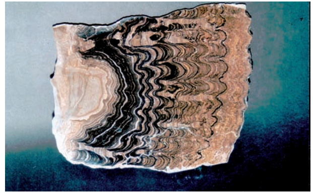
Fig. 7: Stromatolitic algae , 30 x 25 x 7(Bolivia).