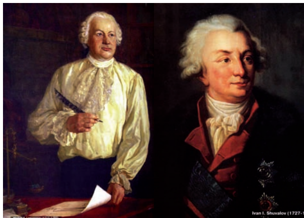
Fig. 1: Michail V. Lomonosov (1711-1765), the scientist-encyclopaedist, the founder of Moscow University.

In 2005, the Lomonosov State University in Moscow celebrated the 250 th Anniversary of its founding. On January 25 th , 1755, Empress Elizabeth (1709-1761), the daughter of Emperor Peter the Great (Peter the 1 st ), signed the decree of the founding of the first Russian university. The outstanding Russian scientist of encyclopaedic knowledge and poet, Michail V. Lomonosov (1711-1765), and the prominent state official and patron of art, Ivan I. Shuvalov (1727-1797), were the founders of the University (Figs 1, 2). Michail V. Lomonosov and Ivan I. Shuvalov are therefore the national pride of Russia.