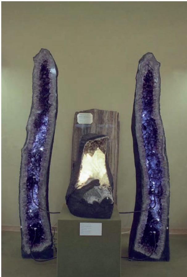
Fig. 6: Two amethyst geodes with large, transparent, dark violet crystals (185 cm and 188 cm in high; 157 kg and 210 kg in weight, respectively), in centre - amethyst geode with gypsum crystals.