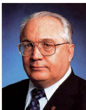
Fig. 3: The Rector at the Lomonosov Moscow State University is the well-known scientist-mathematician, academican Victor A. Sadovnichii.