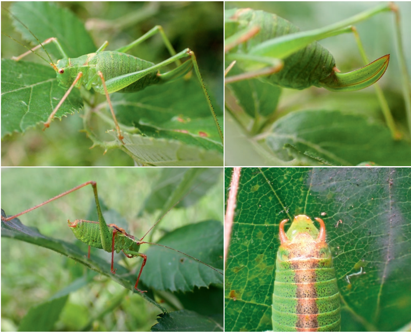
Fig. 1: Leptophyes punctatissima : female (top left), female ovipositor (top right), male (bottom left), and male cerci (bottom right). Pictures from individuals at the site where the population was observed near Neustift/ Novacella.